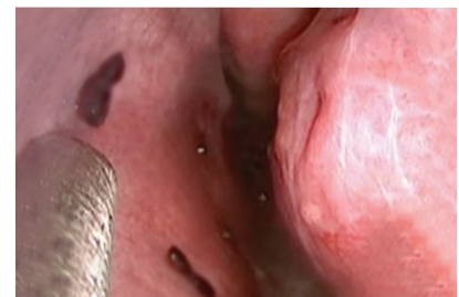
One week postoperative view of implants