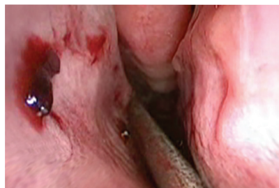
Implants viewed immediately after implantation