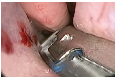
Stapling the septal flaps

The following endoscopic images demonstrate use of the ENTACT septal stapler.